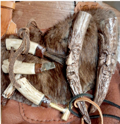
Hand Carved Powder Measures, bags

TheTradersBlanket@yahoo.com www.etsy.com/shop/TheTradersBlanket