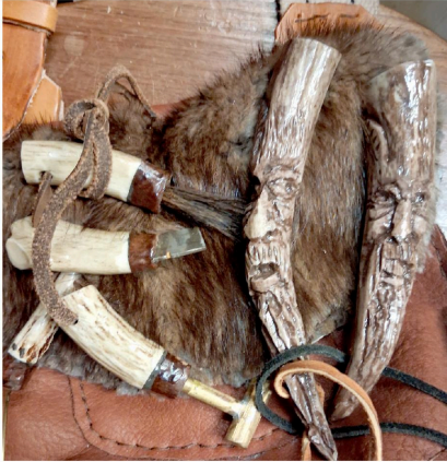
Hand Carved Powder Measures, bags

TheTradersBlanket@yahoo.com www.etsy.com/shop/TheTradersBlanket