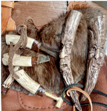
Hand Carved Powder Measures, bags

TheTradersBlanket@yahoo.com www.etsy.com/shop/TheTradersBlanket