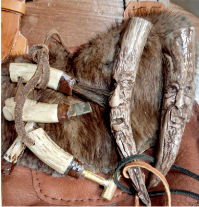
Hand Carved Powder Measures, bags

TheTradersBlanket@yahoo.com www.etsy.com/shop/TheTradersBlanket