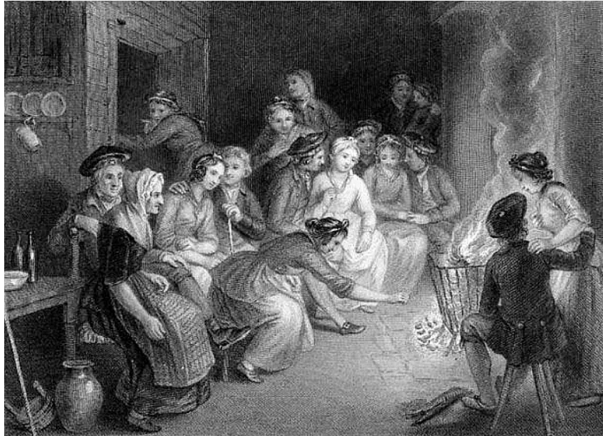
Halloween party of the 1800s.

Editor's note: This history of Halloween was found on a 2013 blog called geriwalton.com - Unique histories from the 18th and 19th centuries.