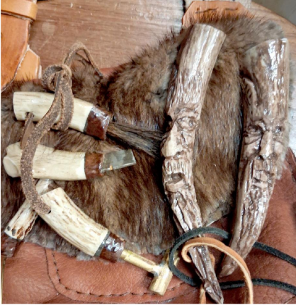
Hand Carved Powder Measures, bags

TheTradersBlanket@yahoo.com www.etsy.com/shop/TheTradersBlanket